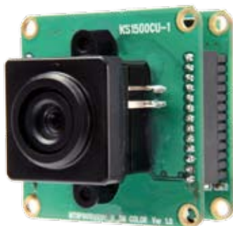
iCube customized solution with AUTOFOCUS lens

The iCube series is also available without housing as small sized and lightweight board level cameras for OEM use. All advantages of the standard iCube camera with housing plus additional customer requirements can be implemented in a board camera at a competitive price level. Specific board level features for customized OEM solutions on request.